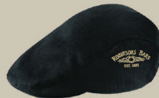
Flat Cap £12