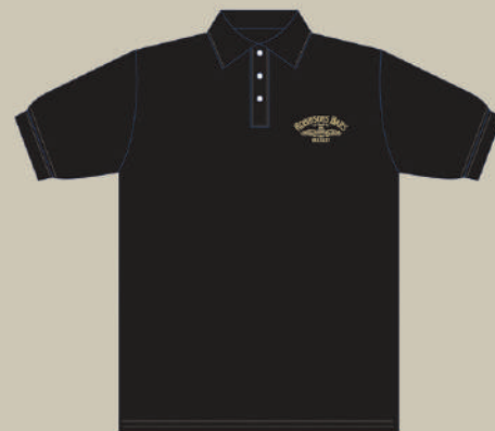
Polo Shirt £15

Official Merchandise available to purchase from the Saloon.